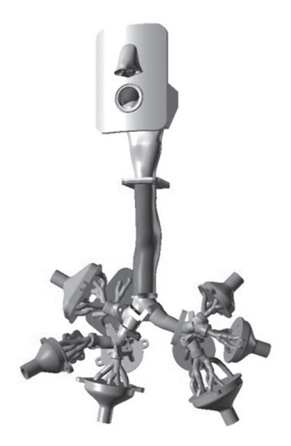
Fig. 1. Visualization of the Brno lung model – the variant of the segmented replica of airways serving for measurement of inhaled particle deposition.

The engineering approach is a problem-solving technique that can be applied not only in the aerospace or automotive industry but also to biological systems, phar-