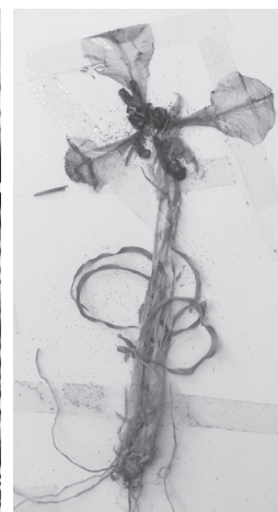
Fig. 1. General view of the living plants and herbariums of the studied species of Irises