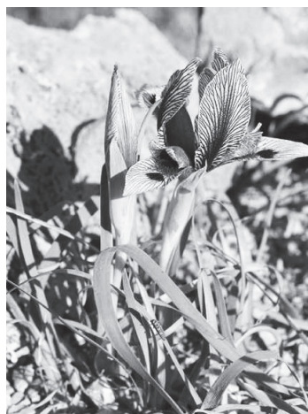
I. medwedewii Fomin