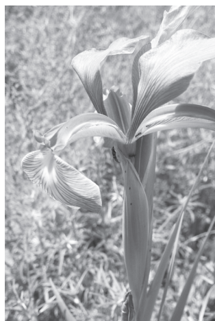
I. carthalinae Fomin

The analysis of the methyl ethers of carboxylic acids was carried out by the method of chromatography-mass-spectrometry 25–27 ) on a 5973N/6890N MSD/DS