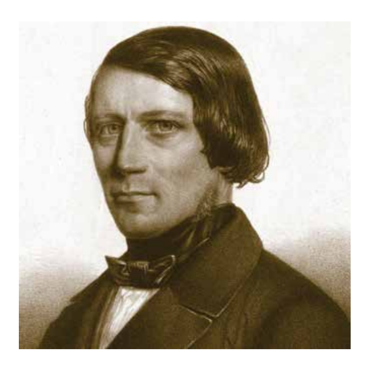
Figure 1. Ferdinand von Arlt (1812–1887) at the age of about 40 (Lithograph by Moritz Golde, printed in the studio of Franz Hanfstaengl in Dresden)