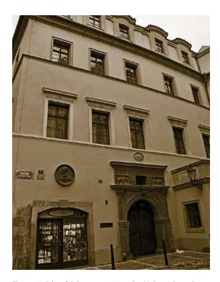
Figure 5. Schwefel Gasse no. 475, today Melantrichova Street no. 16 (Photo: Ben Skála, 2010)

From 1844 to 1847, he lived in the centre of Prague (near the Old Town Square), at Schwefelgasse no. 475/I. Since 1894, it has been called Melantrichova Street (no. 16). Above the entrance are sculptures of two golden bears. That is why the house is called "House at the Two Golden Bears" (Dům u Dvou Zlatých Medvědů). It is a large Renaissance building, one of the oldest buildings in Prague, built in 1559–1567 on the site of two Gothic houses. The building was reconstructed in 1975–1980 [21–23] (Figure 5). In 1846, his teacher J. N. Fischer lived in Prague's New Town at Heinrichsgasse no. 889 on the ground floor (today Jindřišská 17) [24].