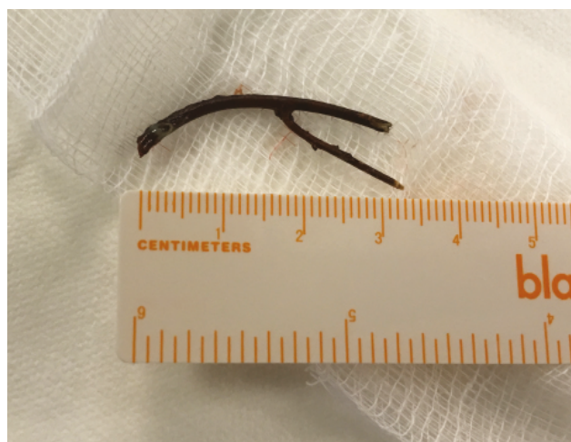
Fig. 4b. Extracted twig from anterior part of orbit

whether the eyeball and optic nerve are damaged or threatened. Penetrating injury of the eyeball must be unequivocally excluded. If the patient's condition so allows, we must examine visual acuity and the ocular fundus.