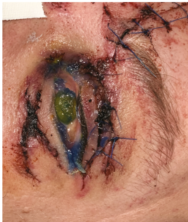
Fig. 8. Photograph shows a rarer complication of oculoplastic traumas – patient after injury (traffic accident) – probably loss injury of upper eyelid following primary reconstruction – with a finding of exposure keratitis with lagophthalmos upon a background of inability to close ocular aperture

This is a relatively rare but serious sight-threatening complication. It represents an urgent condition in which