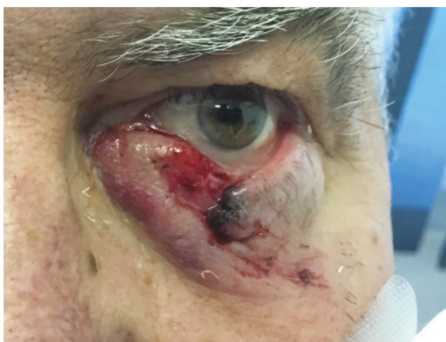
Fig. 2. Lacerated injury to lower eyelid caused by small dog, without injury of canaliculus