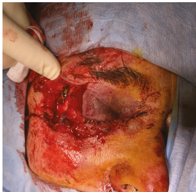
Fig. 6a. Severe injury to orbit and eyelids in traffic accident. Performed reconstruction of the fracture of the outer wall of the orbit by a stomatosurgeon is visible