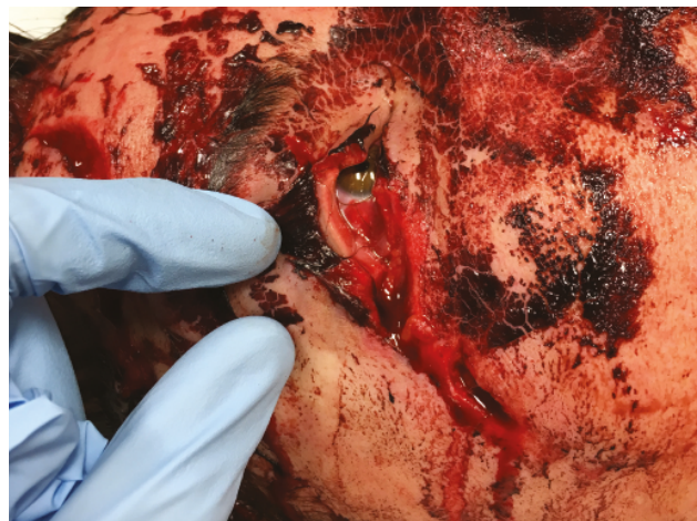
Fig. 3a. Open wound of outer corner, including torn lower canthal ligament. Patient after traffic accident