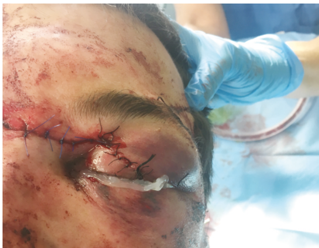
Fig. 5b. Condition immediately after reconstruction of the eyelid by an ophthalmologist