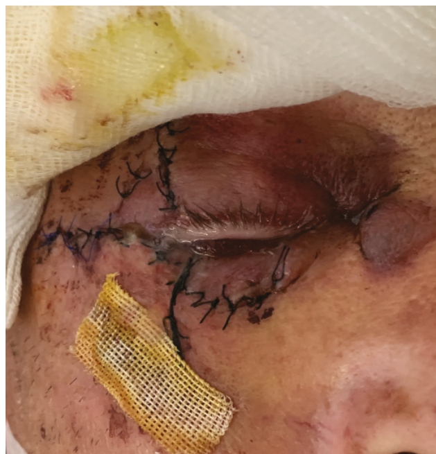
Fib. 6b. Finding at follow-up examination on the first day after reconstruction