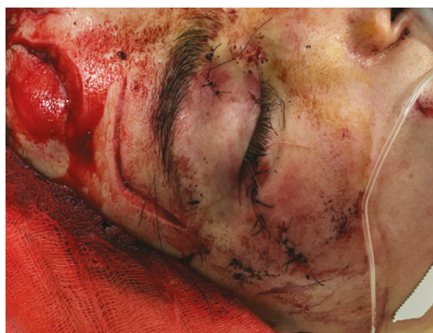
Fig. 3b. State after reconstruction of eyelids by ophthalmologist