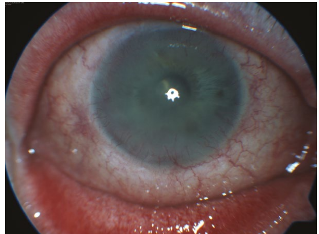
Fig. 5. Right eye of patient from case report 2 with mixed injection of conjunctiva, semitransparent cornea and peripheral limbal superficial and deep corneal vascularisation

A seventy two year old woman was sent to our centre by a local ophthalmologist due to bilateral keratitis upon a background of general pathology of rosacea, for which she had been receiving treatment since 2016. She stated deterioration of vision over the course of approx. 3 weeks, lachrymation and reddening of the eyes. BCVA in the right eye was 1.5/60, in the left eye 0.3/60. Actinic keratosis was visible on the face (Fig. 4). The following finding on the anterior segment was recorded bilaterally: conjunctiva with mixed injection, seropurulent secretion and follicular reaction, cor-