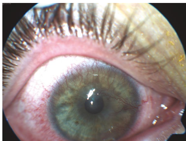
Fig. 2. Right eye of patient from case report 1, visible mixed corneal vascularisation