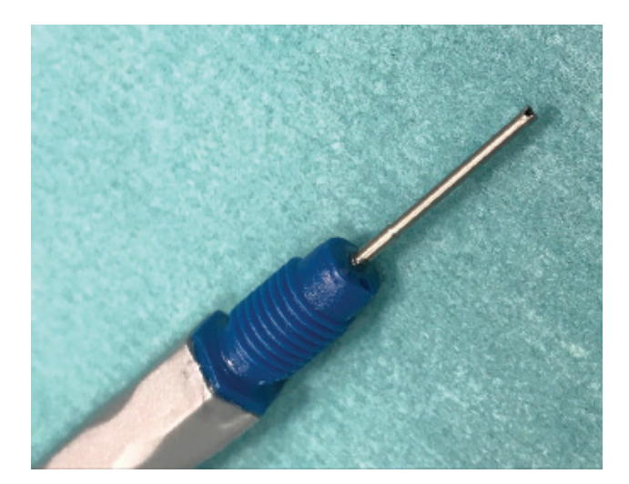
Fig. 2. Detail of end of nanosecond laser

0.98 \pm 0.04 . There was no statistically significant difference between the individual groups (p = 0.65).