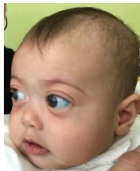
Fig. 2: Central facial dysmorphism, shallow orbits, pseudoexophthalmos, hypertelorism and low root of nose in patient with Marshall/Stickler syndrome at age of 4 months.