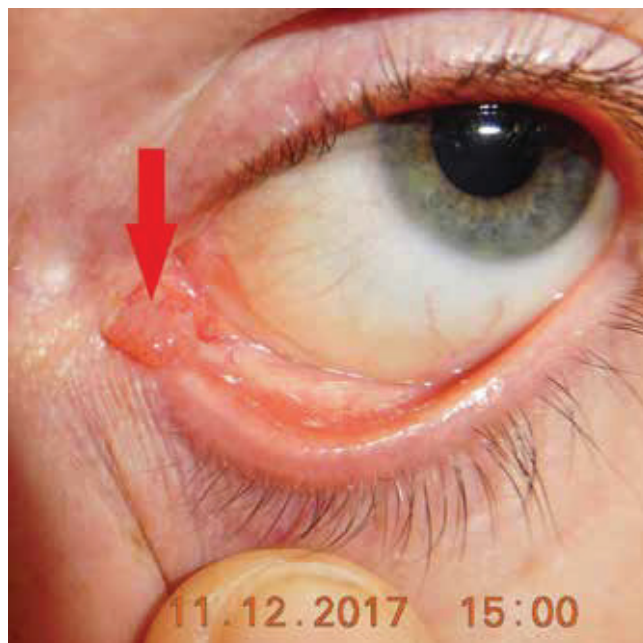
Fig. 4: Clinical picture of a patient with papilloma of caruncula