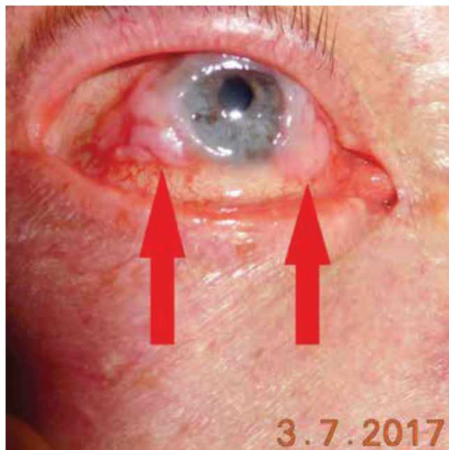
Fig. 6: Clinical picture of a patient with squamous cell carcinoma of bulbar conjunctiva