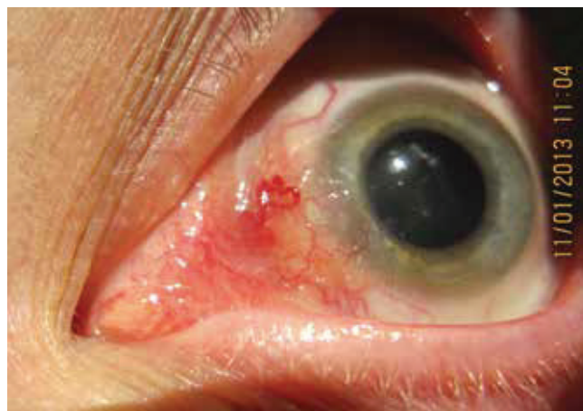
Fig. 1: Clinical picture of a patient with inverted type of conjunctival papilloma in the nasal section of the bulbar conjunctiva (1/2013)

The prevalence of conjunctival papillomas depends on geographical region, but in general it is higher than the prevalence of conjunctival carcinomas. There is a higher incidence in individuals of Caucasian race, male sex, and people aged between 50 and 75 years. In our cohort the highest incidence of lesions was in patients aged between 60 and 70 years, which is in accordance with the available publications. In our cohort we also recorded a higher