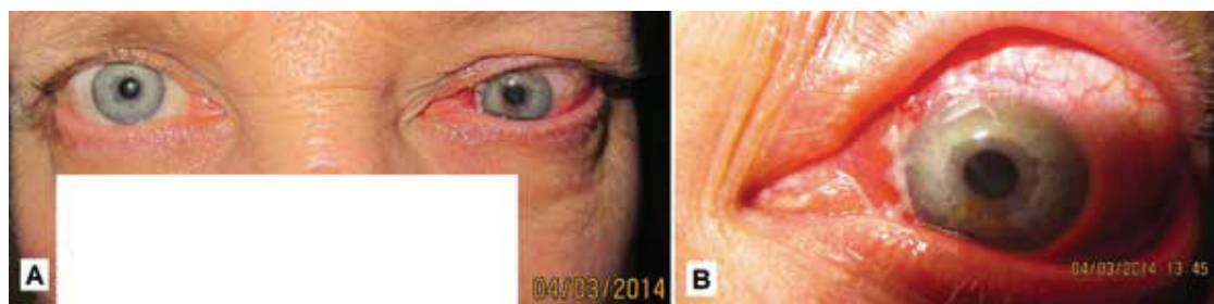
Fig. 2 Clinical picture of the same patient in March 2014 – progression with tendency of infiltration into orbit