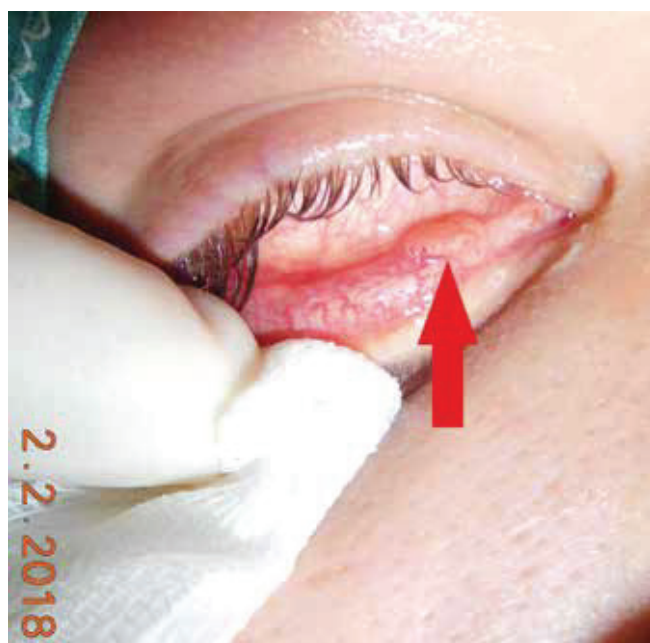
Fig. 3 Clinical picture of a patient with papilloma of conjunctiva on the inner side of lower eyelid