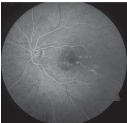
Fig. 3 FAG of left eye. Hyperfluorescence of window defects of RPE in place of inactive inflammatory lesions