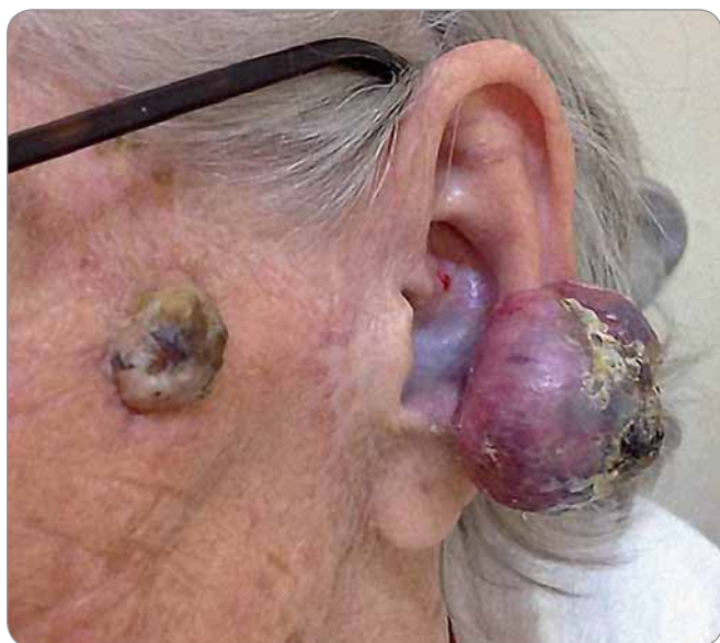
Fig. 1. A solitary erythematous nodule with hyperkeratotic and ulcerated surface on the left ear lobe (front view).