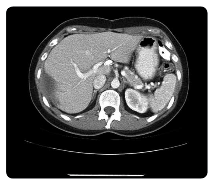
Fig. 3. Significant liver tumor regression during the treatment with imatinib; abdominal metastases are not depicted; December 2010.