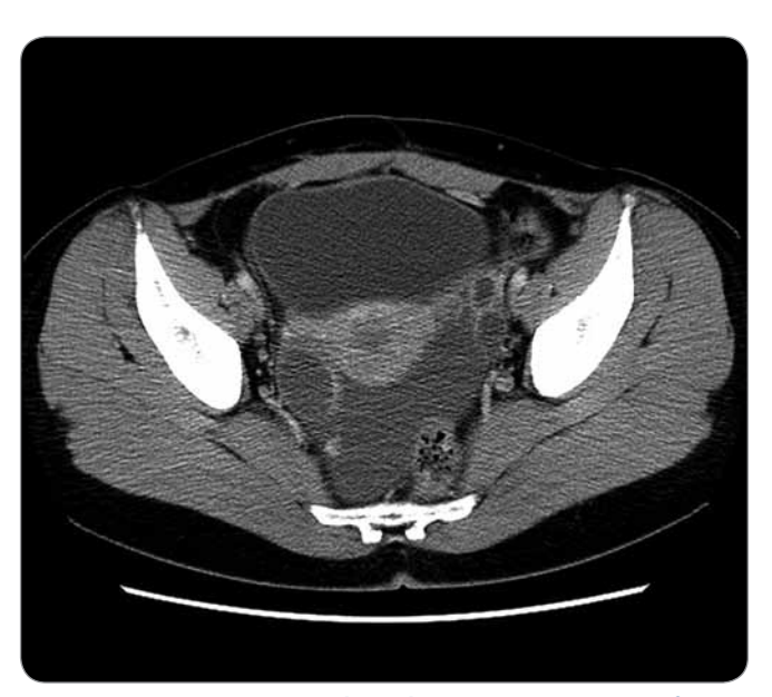
Fig. 2. Large tumor mass in the pelvis prior to initiation of treatment; March 2008.

CK8/18, CD31) were negative. Similarly, immunohistochemistry for C-kit was negative.