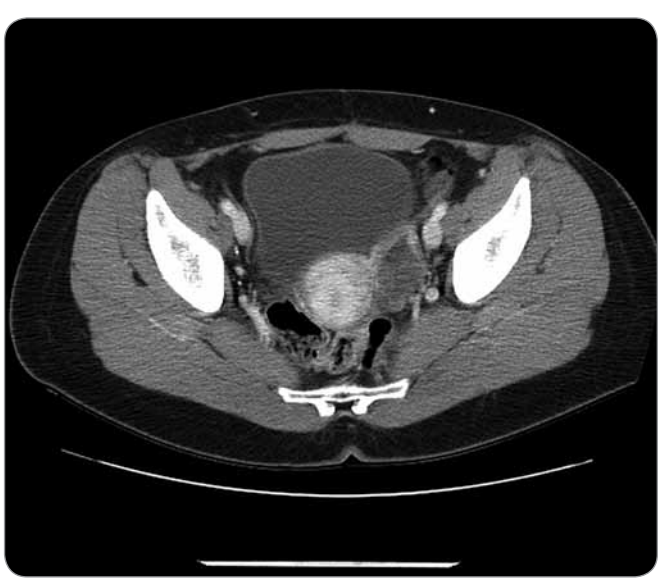
Fig. 4. Significant regression of finding in the pelvis after imatinib therapy; persisting residual cystoid in the left ovary; December 2010.

imatinib mesylate to patients with c-kit negative GISTs, it is necessary to request reimbursement for each respective case.