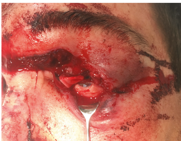
Fig. 5a. Industrial injury by saw. The wound on the upper eyelid is deep enough to cause damage to the musculus levator palpebrae superioris

Minor superficial injuries to the eyelids can be resolved conservatively, with the application of antibiotic cream.