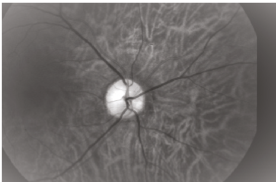
Fig. 2. Photograph of ocular fundus at wavelength of 600 nm (same area as on Fig. 3 and 4).