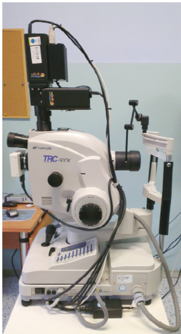
Fig. 1. Retinal oximeter Oxymap T1 (black instrument above) placed on Topcon retinal camera

non-invasive automatic retinal oximeter, a watershed was reached in research into retinal oxygen parameters. The dual non-invasive retinal oximeter Oxymap T1 (Oxymap ehf., Reykjavik, Iceland) is composed of two digital cameras, a special optical adapter, an image divider and two narrow band filters. The entire device is attached to a standard retinal camera (TRC-50 DX, Topcon corp., Tokyo, Japan), which is used to obtain two images of the retina with different wavelengths in a single moment (Fig. 1) [23,24,25]. Light absorbance of the blood vessels is influenced by the absorbance (colour) of the blood in the vessel, which is determined by the presence of oxygenated or non-oxygenated haemoglobin A. Light absorbance of oxygenated and non-oxygenated haemoglobin A differs in several wavelengths, but in some it is the same. These wavelengths are referred to as isosbestic, and one of these is the wavelength of 570 nm. Among others, the wavelength of 600 nm (Graph 1) is non-isosbestic. In comparison with the fluctuating colour