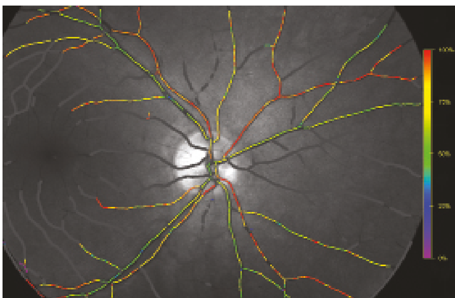
Fig. 4. Oxygen saturation of retinal blood vessels. The colour scale on the right illustrates relative oxygen saturation (same area as on Fig. 2 and 3).