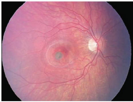
Fig. 1. Initial fundus photography OD: choroidal neovascularisation in juxtafoveolar localisation with significant haemorrhagic serous edema