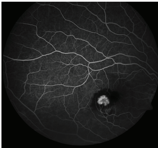
Fig. 3. Fluorescein angiography (FAG) OD: active classic choroidal neovascularisation in juxtafoveolar area

Following consultation with the macular centre of the Clinic of Eye Treatments at Brno Bohunice University Hospital, we applied to the girl 3 injections of ranibizumab (Lucentis) intravitreally, 0.5 mg in 0.05 ml at monthly intervals. With regard to the girl's sensitivity and following consultation with her parents, application took place in standard aseptic conditions always under brief general anaesthesia. No complications were recorded after application.