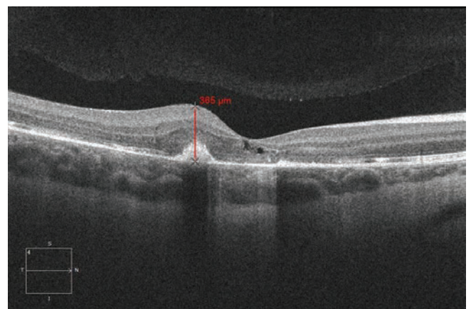
Fig. 4. Spectral HD OCT Linear horizontal macular scan after 3 intravitreal injections of ranibizumab (Lucentis) at monthly intervals with significant regression of macular thickness and volume. Regression of macular thickness of juxtafoveolar area from 680 µm to 365 µm

Barth et al. [1] in their monocentric retrospective study (2008-2016) document the etiology, clinical course and results of treatment in 10 child patients aged under 18 years (average age 13.9 \pm 1.9 years; range 11-16 years) with CNV.