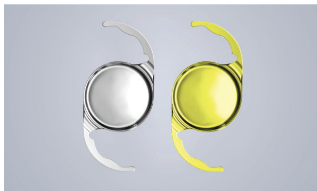
Fig. 1. Lens CT LUCIA 611P (Y)

The improved construction of the “C-loop” haptics, with special curvature without angulation, guarantees a further improved stabilisation and fixation of the lens