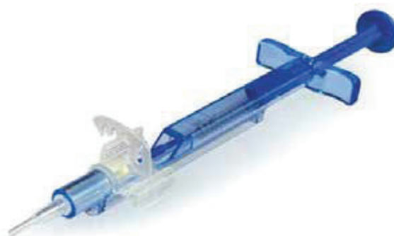
Fig. 2. Injector of lens CT LUCIA 611P (Y)