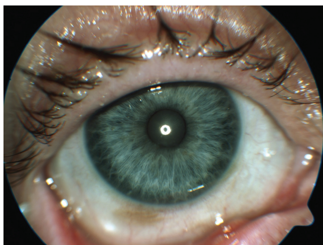
Fig. 3 Finding 3 weeks after commencement of vitamin A substitution per os

patient did not report for any of the originally recommended follow-up examinations.