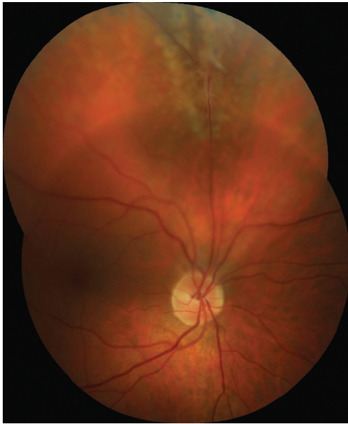
Fig. 4 Colour photographic image of fundus of right eye: proximal segment of persistent hyaloid artery binding to upper temporal arcade, with local tractional retinal detachment of an older date