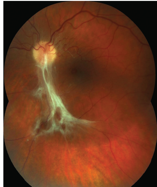
Fig. 5 Colour photographic image of fundus of left eye: preretinal fibrosis in lower temporal arcade causing draping of retina in central landscape

posterior capsule of the lens (fig. 3), also physiological finding on the RE as well as LE. Fundoscopy in mydriasis of the RE demonstrated a proximal part of the PHA adhering to the upper temporal arcade, where it conditioned the origin of local TRD of an older date (fig. 4), in the surrounding area there were