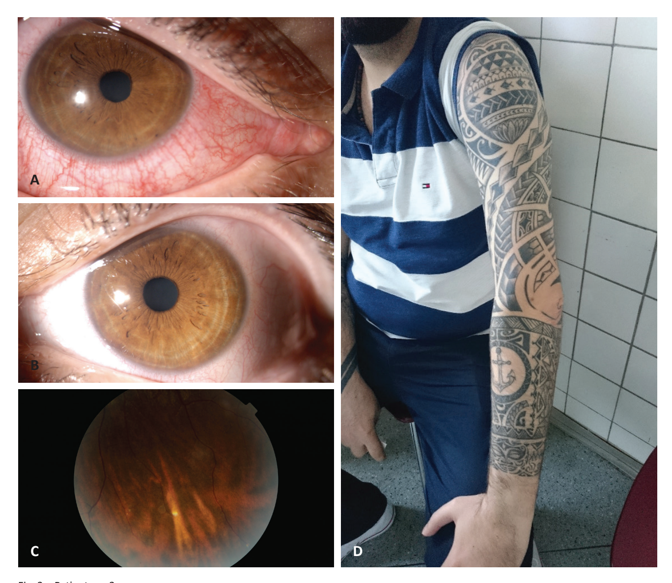
Fig. 2 – Patient no. 2