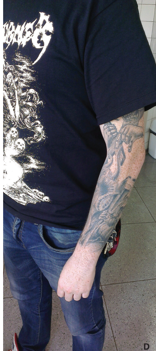
Fig. 1 - Patient no. 1