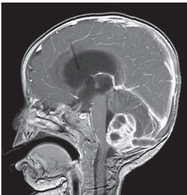
Fig. 1. Sagittal MRI section showing a cerebellar mass lesion communicating subcutaneously through the occipital bone defect.

Dermoid cysts are true ectodermal inclusion lesions lined with epithelium, composed of various amounts of well-differentiated ectodermal and mesodermal elements (endodermal elements are usually not observed, these are more suggestive of a germ cell tumour). Some of these ectodermal inclusions may be hair follicles, sebaceous glands or even sweat glands. The majority of congenital dermoid tumours probably develop during the early stages of development, between the 3 rd to 5 th week of gestation. The presence of another associated congenital anomaly in 50% of patients with dermoid cysts is suggestive of a midline fusion defect. According to the available literature, dermoid cysts are not